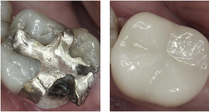
BROKEN TOOTH WITH LARGE SILVER FILLING PATIENT LEAVES WITH NEW CAP IN A SINGLE VISIT