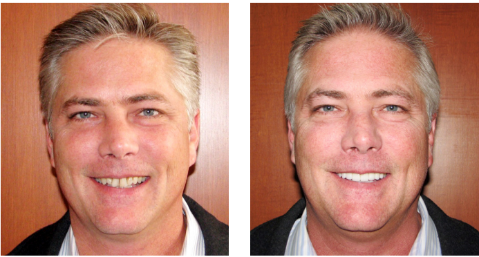
BEFORE SAME DAY SMILE AFTER