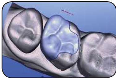
CAD/CAM restoration image