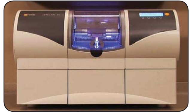
CAD/CAM milling machine